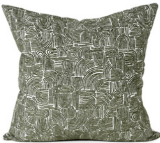
FORREST SWIRL DDCUSFOR001 - 57 x 57