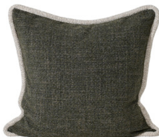
WOVEN MOSS DDCUSWOVMO001 - 57 x 57