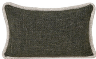
WOVEN MOSS DDCUSWOVMO002 - 37 x 57