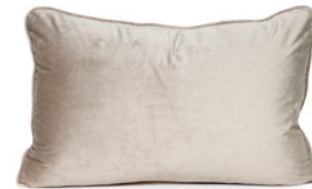
NOUGAT VELVET DDCGN003SP - 37 x 57

The natural tones of Dune blends tactile textures that soothe the senses – elegant tweed and leather compliment relaxed mohair and cord.