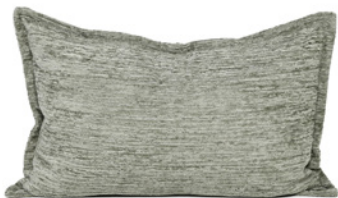
RUFFLED SAGE DDCUSRUF002 - 37 x 57