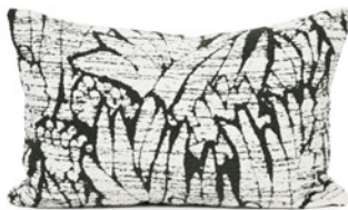
GREEN PALM DDCUSPALMG002 - 37 x 57