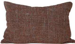
CHACHA CARAMEL DDCCTCC003 - 37 x 57