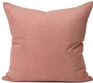
ARGILE CORD DDCCORA001 - 57 x 57