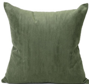
MILITARY GREEN CORD DDCCORMG001 - 57 x 57