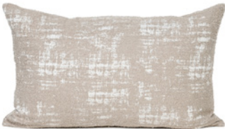
STORMY OAT DDCUSSTOO002 - 37 x 57