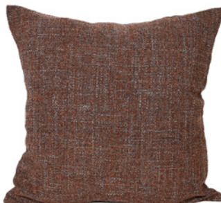
CHACHA CARAMEL DDCCTCC001 - 57 x 57