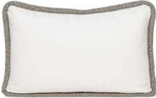
CAPPUCINO MOHAIR DDCUSMOHC002 - 37 x 57