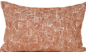
RUSTED SWIRL DDCUSRUSS002 - 37 x 57