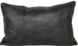
ART LEATHER ONYX DDCUSARTLO002 - 37 x 57