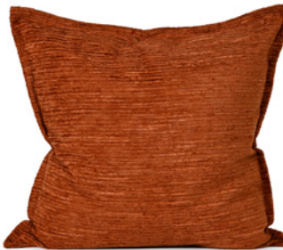
RUFFLED AUTUMN DDCUSRUFA001 - 57 x 57