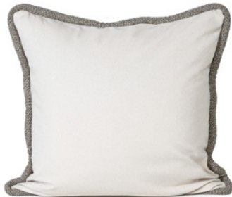
CAPPUCINO MOHAIR DDCUSMOHC001 - 57 x 57