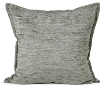
RUFFLED SAGE DDCUSRUF001 - 57 x 57