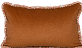
TOBACCO MOHAIR DDCUSFELT002 - 37 x 57