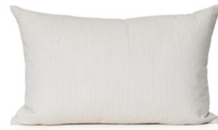
CREAM CORD DDCCORC003 - 37 x 57