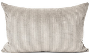
OATMEAL CORD DDCCOROA003 - 37 x 57