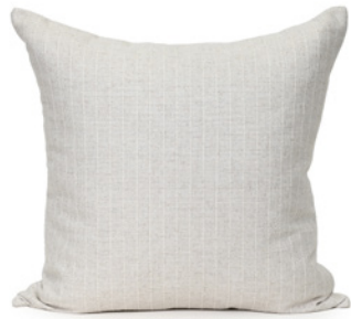
SANDY PINSTRIPE DDCCTSP001 - 57 x 57