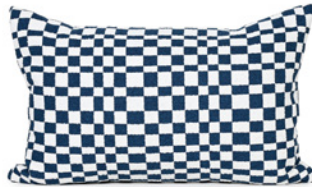
BLOCKS IN BLUE DDCUSBLOCKB002 - 37 x 57