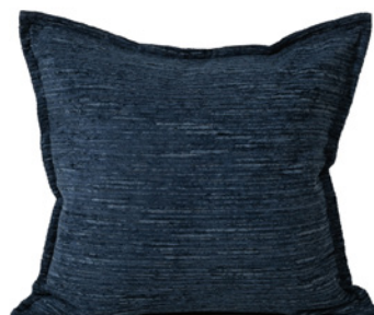
RUFFLED INDIGO DDCUSRUF001 - 57 x 57