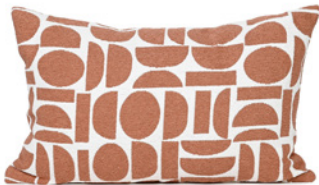
CORAL POP DDCUSOPM002 - 37 x 57