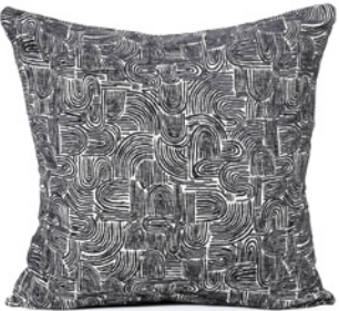
CHARCOAL SWIRL DDCCTCHS001 - 57 x 57