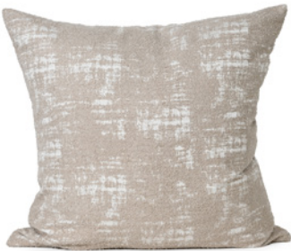
STORMY OAT DDCUSSTOO001 - 57 x 57