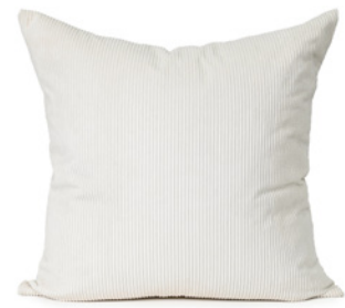
CREAM CORD DDCCORC001 - 57 x 57