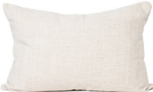
CHACHA BEIGE DDCCTCB002 - 37 x 57