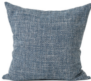
OCEAN TEXTURE DDCUSCHAO001 - 57 x 57