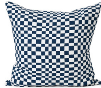
BLOCKS IN BLUE DDCUSBLOCKB001 - 57 x 57