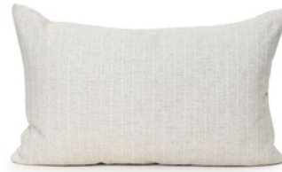
SANDY PINSTRIPE DDCCTSP003 - 37 x 57