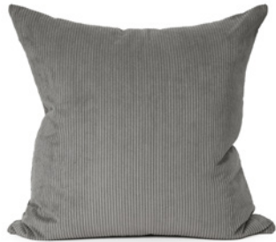
GREY CORD DDCCORG001 - 57 x 57