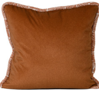
TOBACCO MOHAIR DDCUSFELT001 - 57 x 57