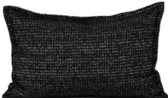
DARK SABLE DDCUSSABD002 - 37 x 57