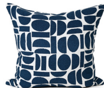
SANTORINI POP DDCUSPOPS001 - 57 x 57