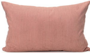
ARGILE CORD DDCCORA003 - 37 x 57