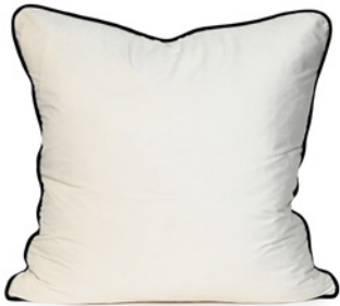
IVORY VELVET DDCGTI001B - 57 x 57