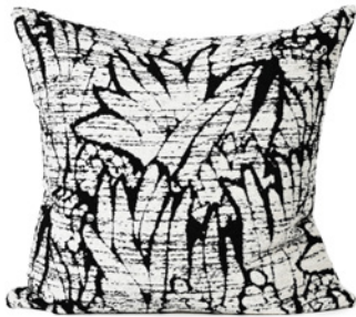
BLACK PALM DDCUSPALMB001 - 57 x 57