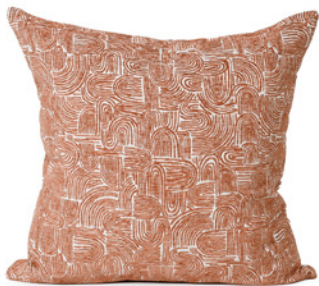
RUSTED SWIRL DDCUSRUSS001 - 57 x 57