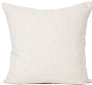
CHACHA BEIGE DDCCTCB001 - 57 x 57