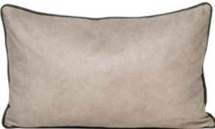
ART LEATHER TAUPE DDCUSARTLT002 - 37 x 57