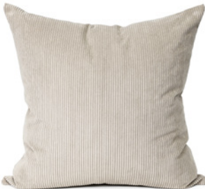
OATMEAL CORD DDCCOROA001 - 57 x 57