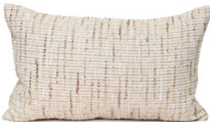
NATURAL TWEED DDCCTNT003 - 37 x 57