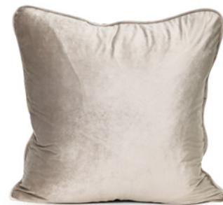
NOUGAT VELVET DDCGN001SP - 57 x 57