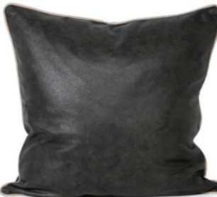
ART LEATHER ONYX DDCUSARTLO001 - 57 x 57