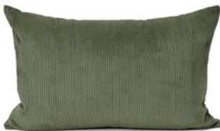
MILITARY GREEN CORD DDCCORMG003 - 37 x 57