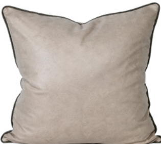
ART LEATHER TAUPE DDCUSARTLT001 - 57 x 57