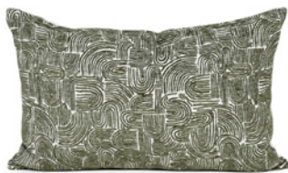
FORREST SWIRL DDCUSFOR002 - 37 x 57