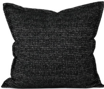
DARK SABLE DDCUSSABD001 - 57 x 57