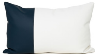
NAUTICAL SMOOTH WHITE DDCUSNATS002 - 37 x 57