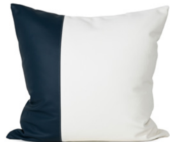
NAUTICAL SMOOTH WHITE DDCUSNATS001 - 57 x 57