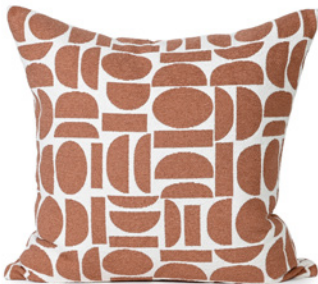
CORAL POP DDCUSOPM001 - 57 x 57