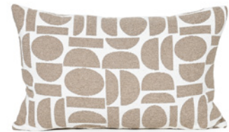
MUSHROOM POP DDCUSPOPM002 - 37 x 57