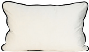
IVORY VELVET DDCGTI003B - 37 x 57