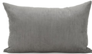
GREY CORD DDCCORG003 - 37 x 57