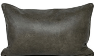
ART LEATHER MILITARY DDCUSARTLM002 - 37 x 57

Explore the enduring tranquillity of sage, moss, olive and deep forest greens across comfortably elegant fabrics.