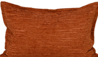
RUFFLED AUTUMN DDCUSRUFA002 - 37 x 57