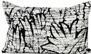
BLACK PALM DDCUSPALMB002 - 37 x 57