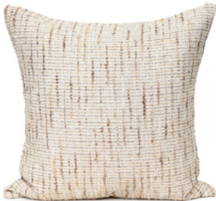
NATURAL TWEED DDCCTNT001 - 57 x 57