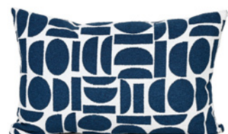
SANTORINI POP DDCUSPOPS002 - 37 x 57