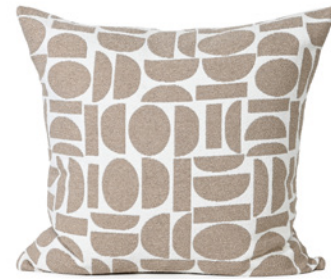
MUSHROOM POP DDCUSPOPM001 - 57 x 57