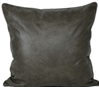
ART LEATHER MILITARY DDCUSARTLM001 - 57 x 57