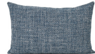
OCEAN TEXTURE DDCUSCHAO002 - 37 x 57