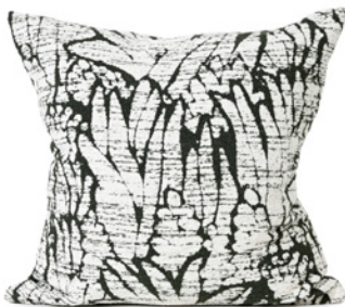
GREEN PALM DDCUSPALMG001 - 57 x 57