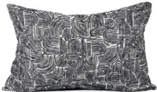
CHARCOAL SWIRL DDCCTCHS003 - 37 x 57